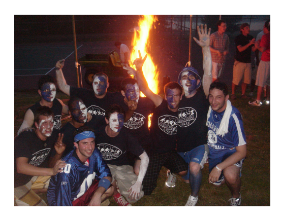
Counselors celebrate a rope burn victory.

We hope you had a great summer and we wish you a terrific year ahead.