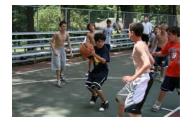
Basketball at the Lower Hoops

The next Alumni Reunion is tentatively scheduled for September 11 and 12, 2010!!