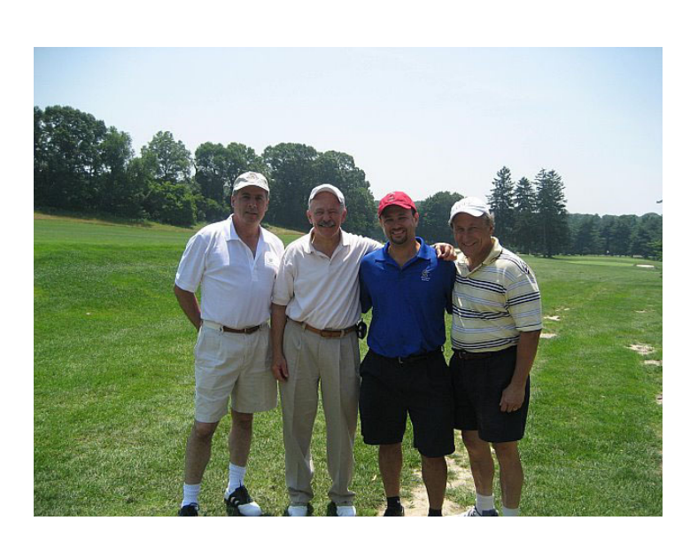
The Groothuis Foursome