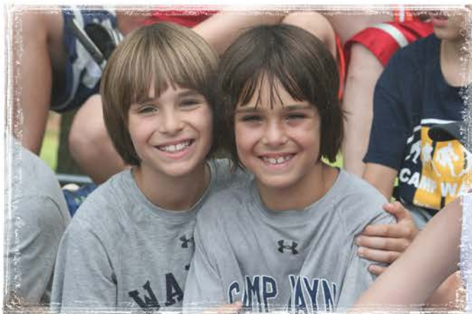
The Oppenheim Boys